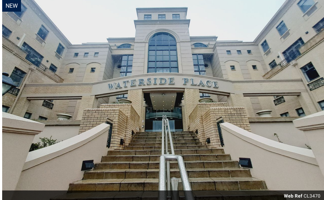
Web Ref CL3470